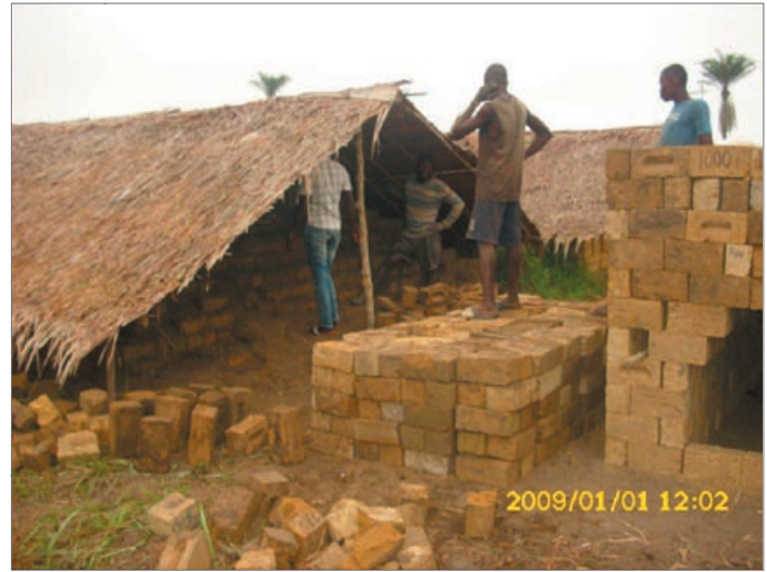
Dried bricks are mounted into a kiln. Then they are covered with mud and burned, to test their quality.