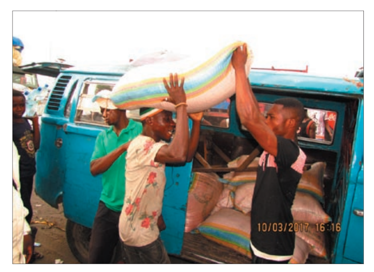
500 kg of special maize seeds for agricultural project

For the construction of the school building, 30.000 bricks were fabricated