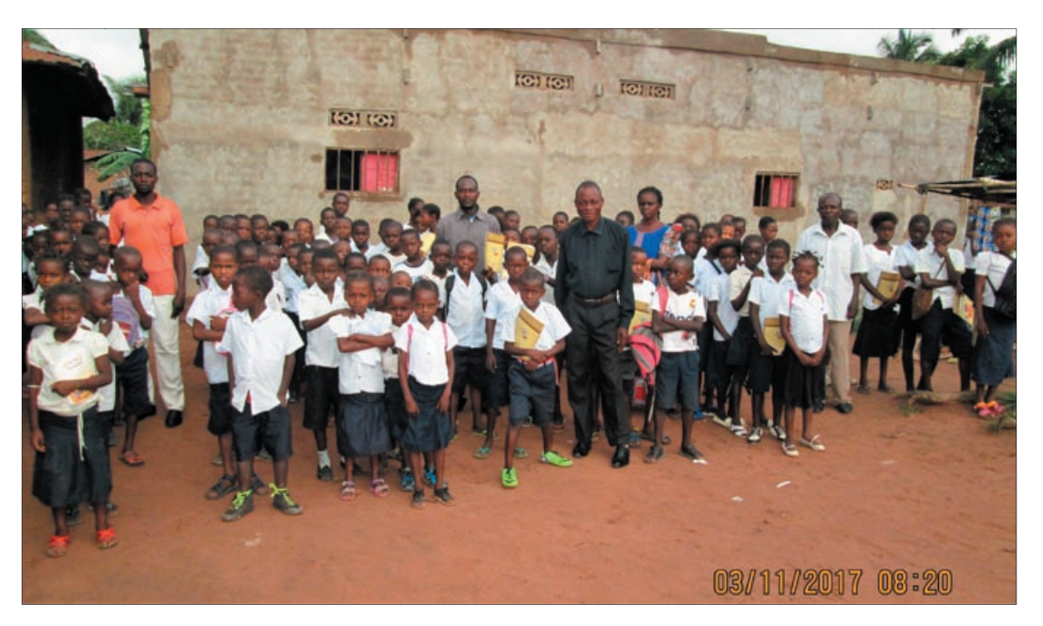
80% of the school children from Mushapo continue their schooling in Tshikapa