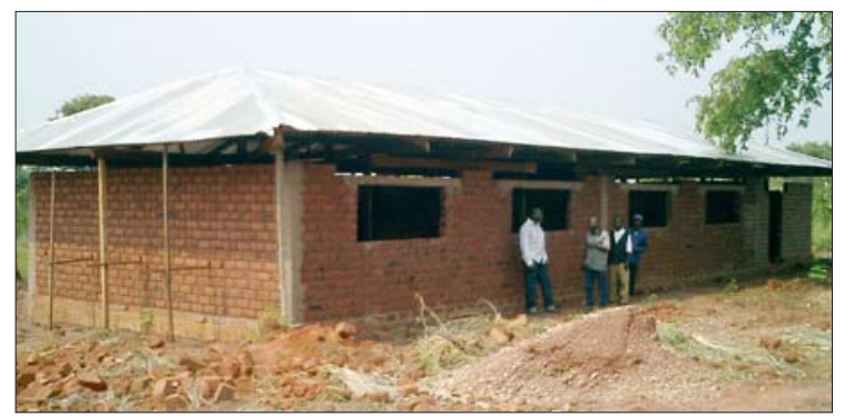
Left: First comes the roof to protect the construction from the rain, then the walls go up. Right: ... almost finished now!