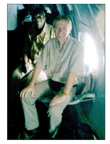
Inside the cargo plane or ...