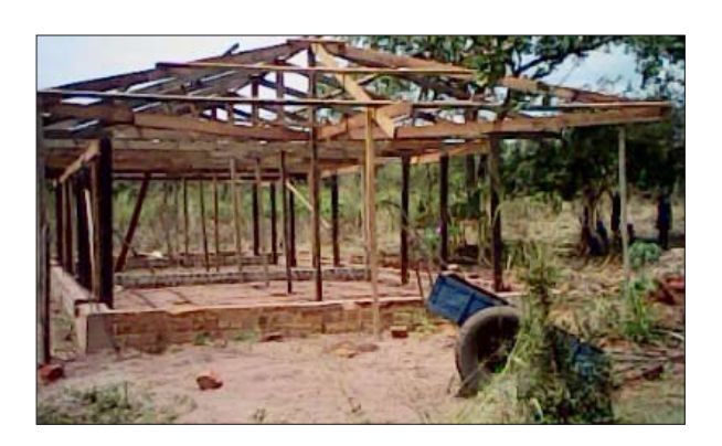
Roof construction of our second school building

The second brick building is almost finished, but we need 4 more and are looking for the needed finances. We would also like to invest more into the agricultural project so it can create better income in the future. One positive side-effect of the increase in all these activities is that it creates more jobs for the local people: teachers, guards, farm and construction workers etc. Our project means also an enormous encouragement for the people of Mushapo and the