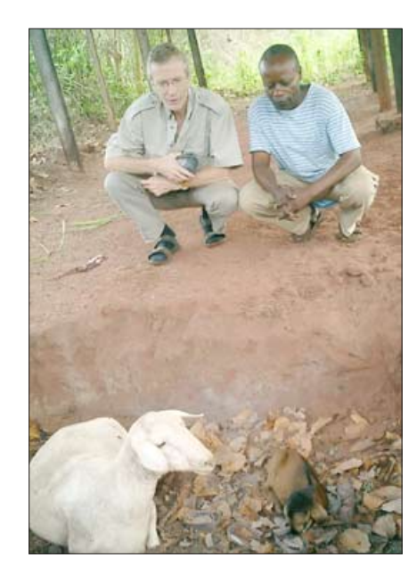
Our first newborn baby lamb