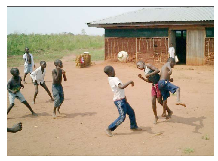
It's so much fun for the kids to play with a real soccer ball!