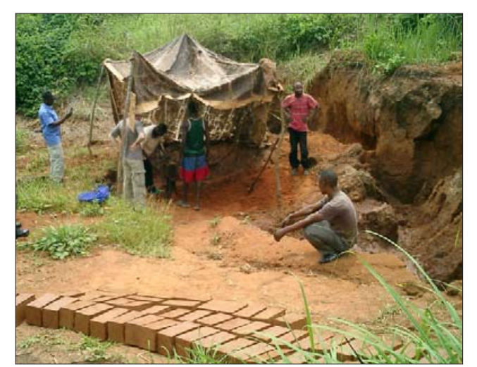
More bricks are being pressed, dried and baked.