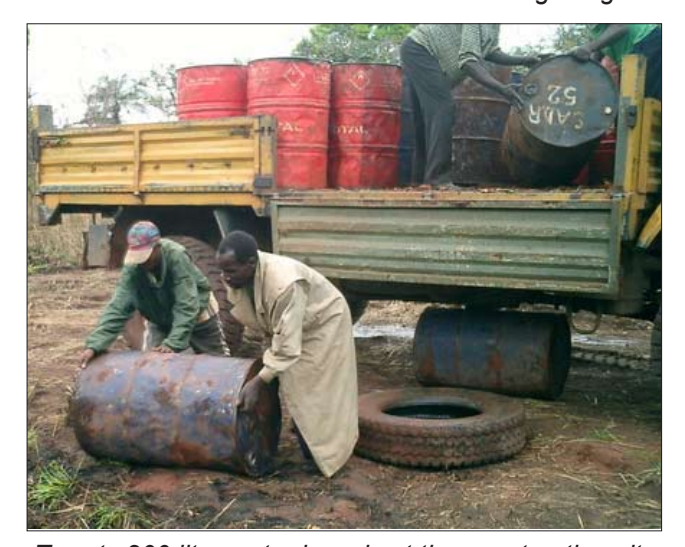
Twenty 200 liter water barrels at the construction site