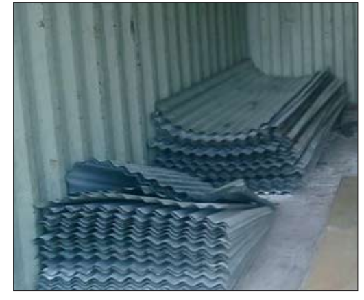
Wooden planks & beams for the roof, doors etc. Iron for the foundation & pillars. Corrugated metal sheets for the roof.