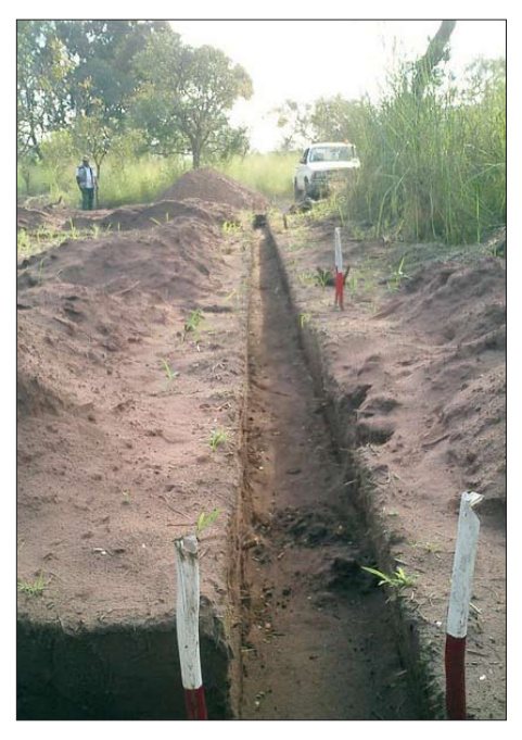
Foundation ditches for the school

Building a solid construction in the bush is no easy order to complete the picture.