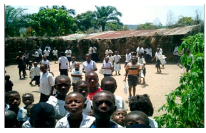
Public school ADAF in Mokali for 900 children

Now some highlights about our work here: Since September all school aged orphans are enrolled in school, a big step forward in our care for them. Before we can start with our own school building we still have to jump a few legal hurdles, so that afterwards the building cannot be misused.