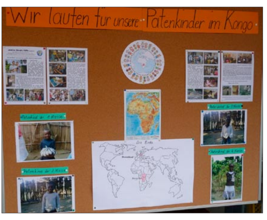
The school presents our project and their four adopted orphans