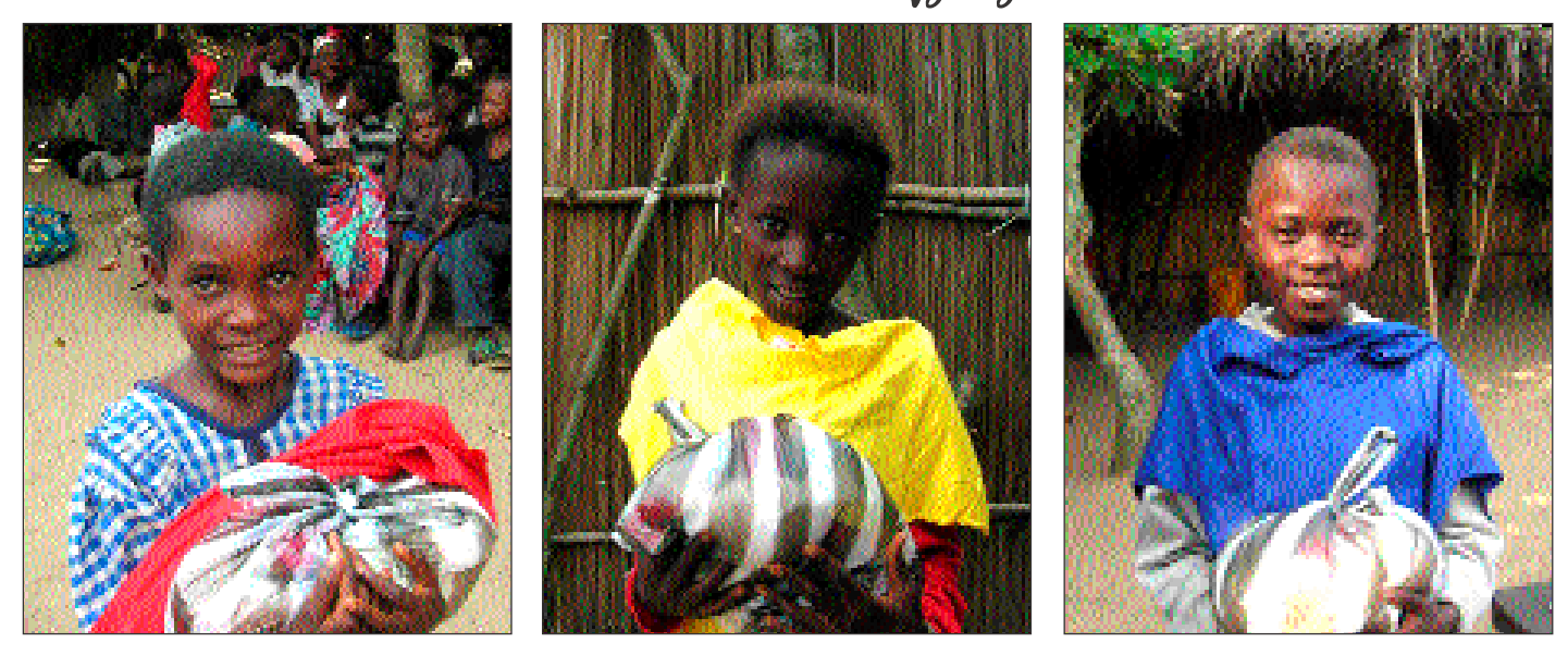
The children in Mokali are very thankful for their weekly food packages and new T-shirts donated from a friend in Dubai

Bank account: Aktive Direkt Hilfe e.V., Postbank Dortmund, number 298 000 461, BLZ 440 100 46, IBAN: DE 92 4401 0046 0298 0004 61, BIC: PBNKDEFF