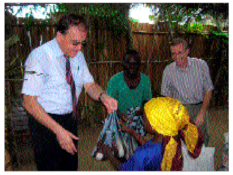
The German Ambassador helps with the food distribution in Kikimi/Mokali