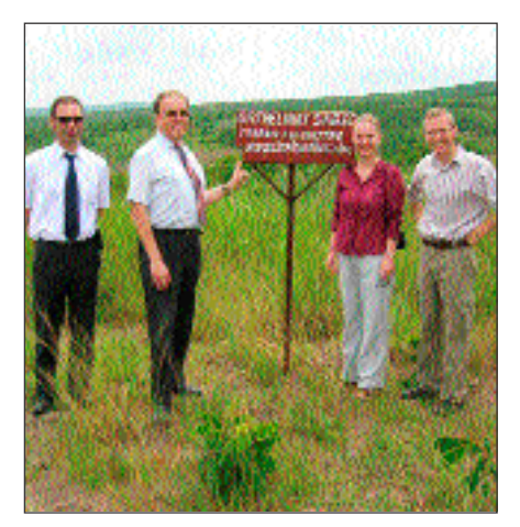
This is where we plan the building

cook works outside under a roof where the children can also wash their hands. An out-house toilet will be separate as there is also no running water.