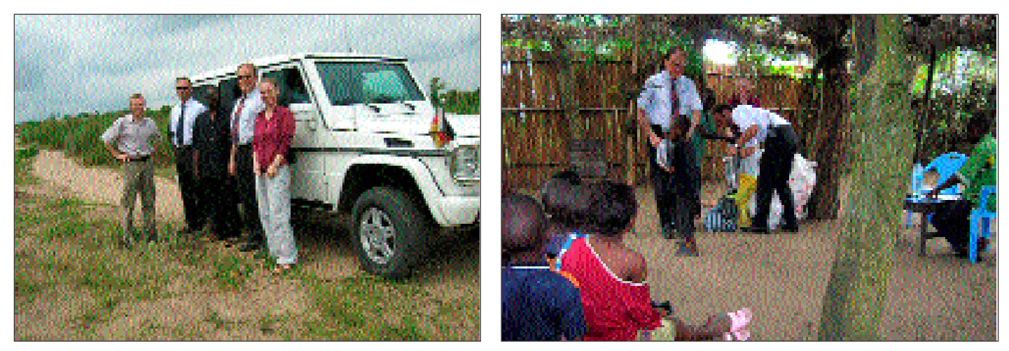
German Ambassador and security officer visit our field-project in Mokali. He said that he enjoyed the food distribution.