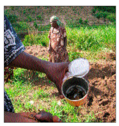
Granny boils these cricket larva

Some of you asked us how it is going with the minimum support for the children. The 10 Euros per child per month barely