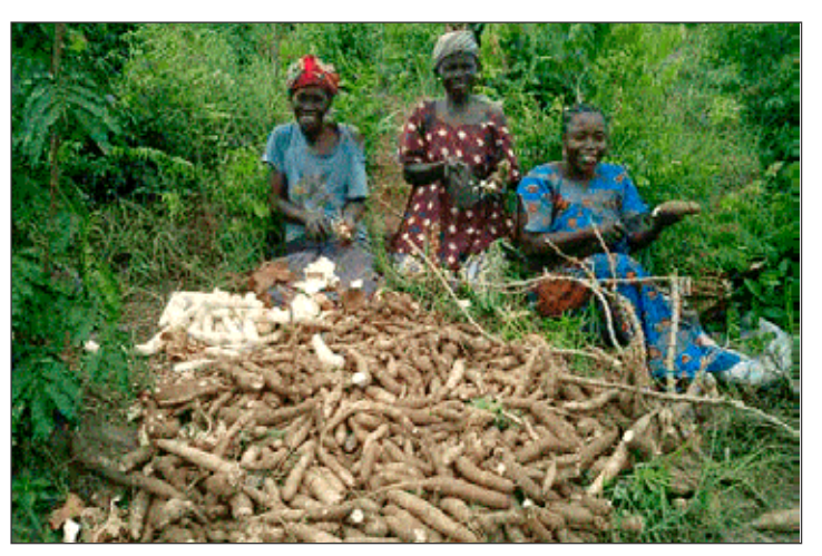
The final product: freshly harvested kassawa potatoes