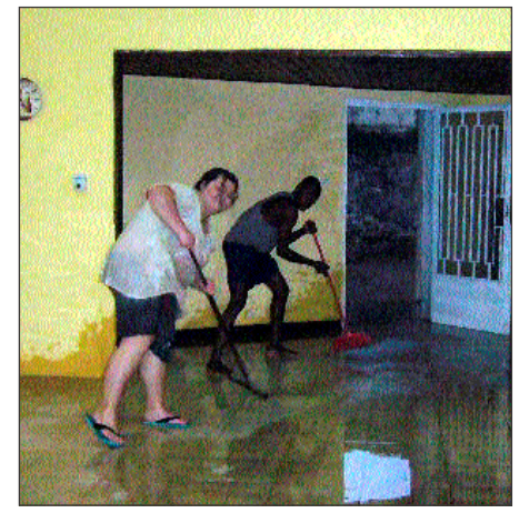
Big rainfalls flooding our house

On the other hand we had some great victories. After we moved into our new house one of our close friends proclaimed: "Now you have a seat in Congo!" Our dear landlord continues to help us get set up and we are very thankful for our many local friends who donated different items so we could get the house in order and have the basics to operate with. Some close friends of William in Italy donated a desperately needed car for which we are especially thankful since it's so difficult to