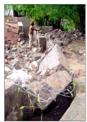
The neigbors broken wall