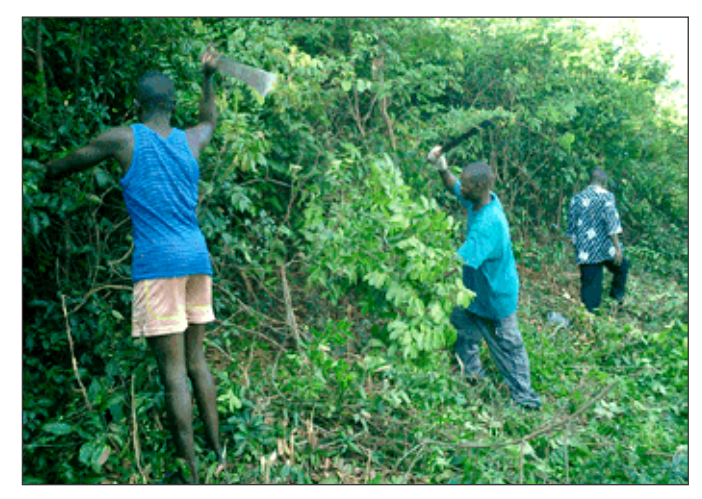
Preparing another part of the field for planting seedlings