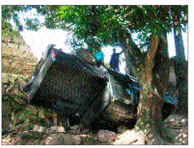
No one got hurt: car broke through our front wall